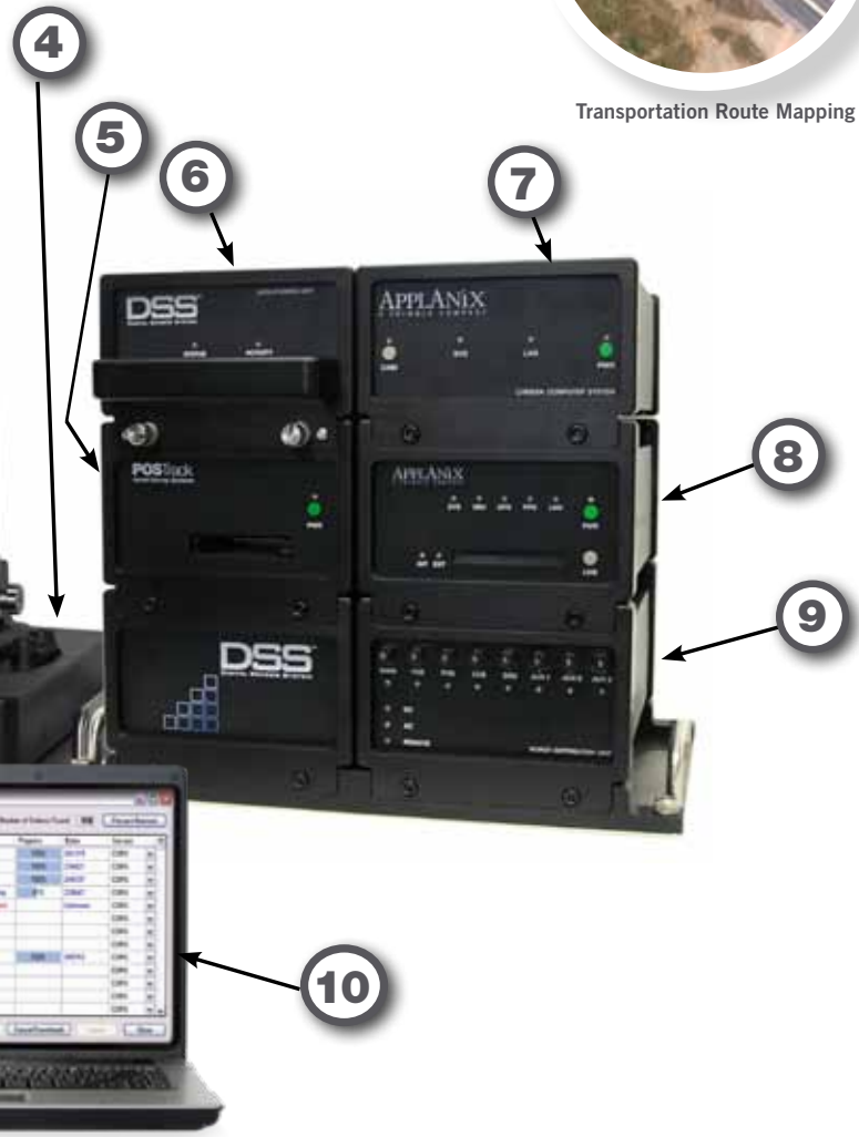
Transportation Route Mapping